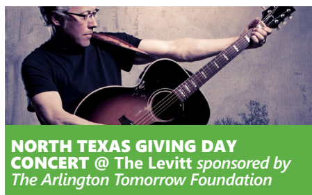
NORTH TEXAS GIVING DAY CONCERT @ The Levitt sponsored by The Arlington Tomorrow Foundation

Save the date! During North Texas Giving Day, everyone can be a philanthropist online from 6AM to midnight. Will you join us? In 2019, more than $50 million was raised for 3,000 local nonprofits.