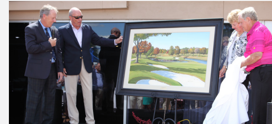
DAC has two 18-hole golf courses designed by Jack Nicklaus