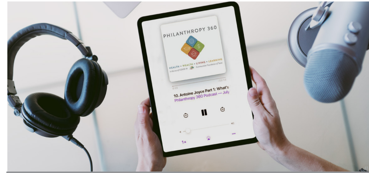
Catch up on Philanthropy 360 Season 1 and the start of Season 2.

WE AT CFT are constantly asking, “What is ours to do?” In April 2020, we answered the question by launching Philanthropy 360 , a podcast for nonprofits and others striving to build thriving communities through health, wealth, living, and learning.