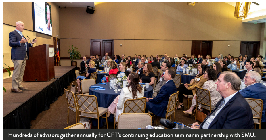
Hundreds of advisors gather annually for CFT’s continuing education seminar in partnership with SMU.

Save the date for our 2024 seminar on May 14, 2024 .