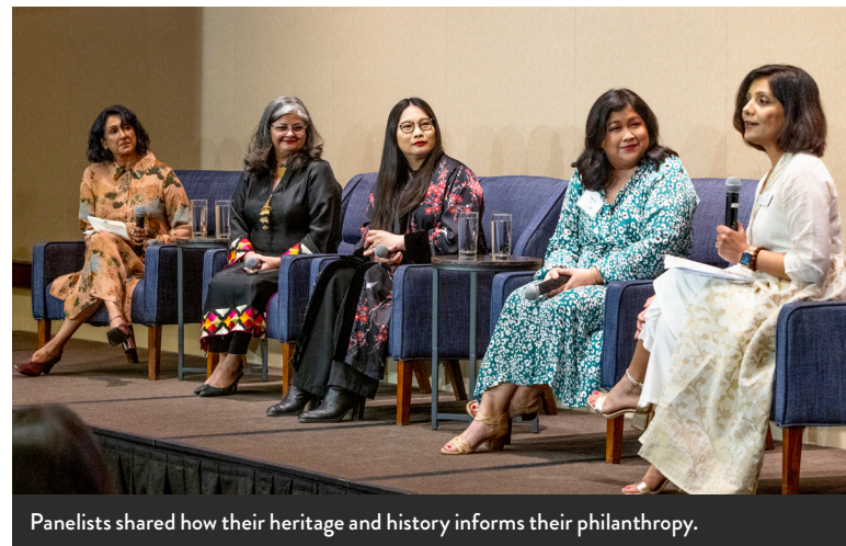
Panelists shared how their heritage and history informs their philanthropy.