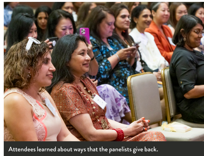
Attendees learned about ways that the panelists give back.