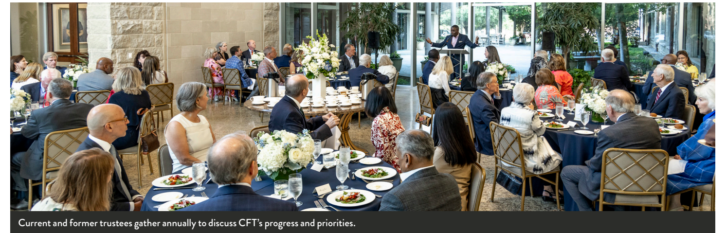
Current and former trustees gather annually to discuss CFT's progress and priorities.