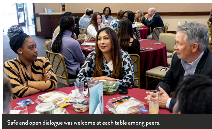
Safe and open dialogue was welcome at each table among peers.

CFT for Business partnered with Project Unity to host a “Together We Dine” event for our Business Impact Network Members . Led by trained facilitators, attendees engaged in courageous and safe conversations about race relations, beliefs, and differences. CFT for Business members: Join us for a “Together We Dine” luncheon on Thursday, October 26.